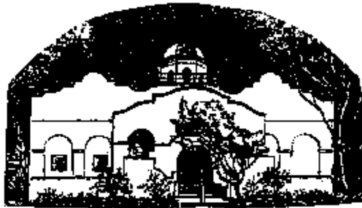
MONTARA GARDENS LOCATED IN THE FORMER MONTARA GRAMMAR SCHOOL CIRCA 1915

PERFORMANCE AND EVENT PARKING REGULATIONS ARE EXTREMELY IMPORTANT AND MUST TO ADHERED TO AT ALL TIMES OUR USE PERMIT REQUIRES THIS.