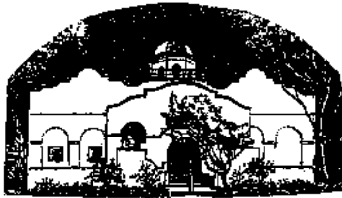
MONTARA GARDENS LOCATED IN THE FORMER MONTARA GRAMMAR SCHOOL CIRCA 1915

PERFORMANCE AND EVENT PARKING REGULATIONS ARE EXTREMELY IMPORTANT AND MUST TO ADHERED TO AT ALL TIMES OUR USE PERMIT REQUIRES THIS.